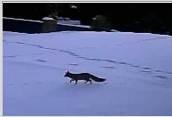
These suspicious characters were captured loitering around the neighborhood.